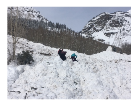
Sunday 8:30am- 5:00pm